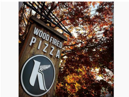
Message: Have you tried the wood-fired pizza at The Kaatskeller yet? 🍕 If not, you're missing out on a slice of heaven! 🍷 🍷 : @thekaatskeller . ....