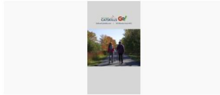
Ad Name: Fall Video Ad Campaign Name: Traffic Campaign