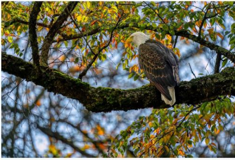
Message: Eagle eyed people can view the fall foliage this week. #sullivancatskills #catskills #catskillmountains #fall...