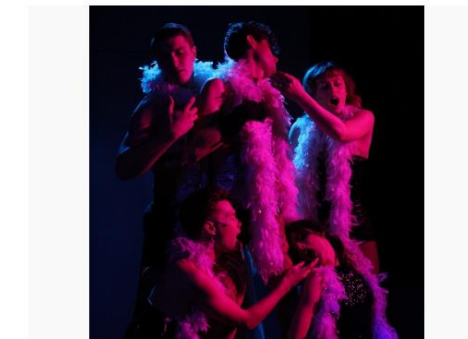
Message: 🎃 Calling all Rocky Horror Picture Show fans! 🎉 Join Forestburgh Playhouse every weekend as they bring the cult classic to life...