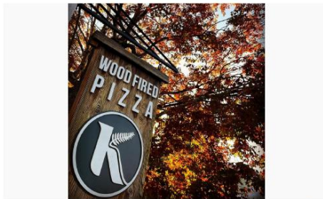
Message: Have you tried the wood-fired pizza at The Kaatskeller yet? 🍷 If not, you're missing out on a slice of heaven!