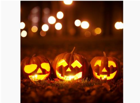
Message: 🎃 Peace, Love & Pumpkins 🎃 An enchanting walk-thru Halloween experience in our beautiful Sullivan Catskills at Bethel Woods...