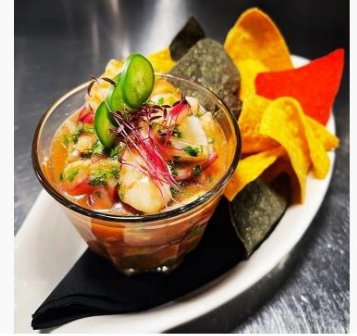
Message: Get ready for a flavor explosion at Tango Café with their Shrimp Ceviche Passion Fruit Citrus Marinaded! 🍷