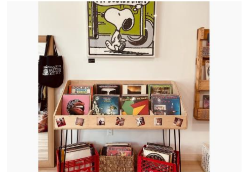
Message: All That Glitters Is Old but in the best way possible! ✨🌟 Rediscover the magic of music with vintage vinyl records 🎵📀🎧...