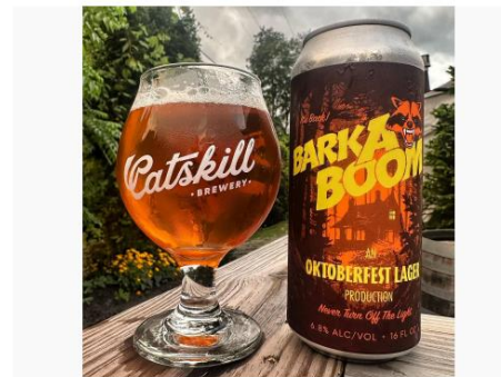
Message: It's a spooky time at The Catskill Brewery 🍷 Try their Bark-A-Boom lager during your next visit! YUM! 🍷 : @thecatskillbrewery . ....