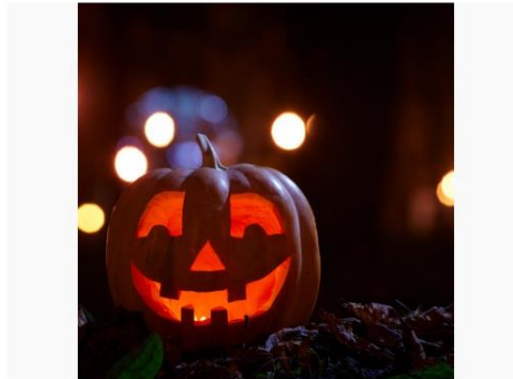
Message: Get ready for a spooooky and fun-filled weekend at @betheL_pastures_farm! 🎃 Starting in October through Columbus Day...