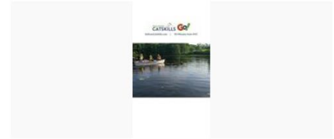
Ad Name: Summer Campaign_v1_2023 Campaign Name: Traffic Campaign