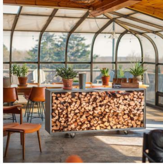
Message: Book a stay at The Arnold House and begin your week of relaxation. 🍷 #catskillsny #sullivancatskills...