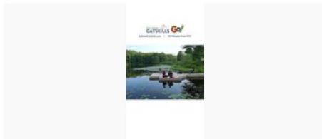
Ad Name: Summer Campaign_V2_2023 Campaign Name: Traffic Campaign