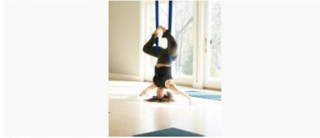
Ad Name: Wellness 2025 Ad Campaign Name: Traffic Campaign