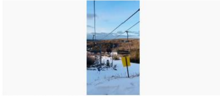
Ad Name: Skiing 2025 Ad Campaign Name: Traffic Campaign