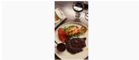
Ad Name: Restaurant Week Ad Campaign Name: Traffic Campaign