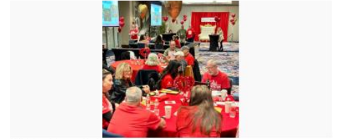
Ad Name: Heart-A-Thon Boost Campaign Name: Heart-A-Thon Boost