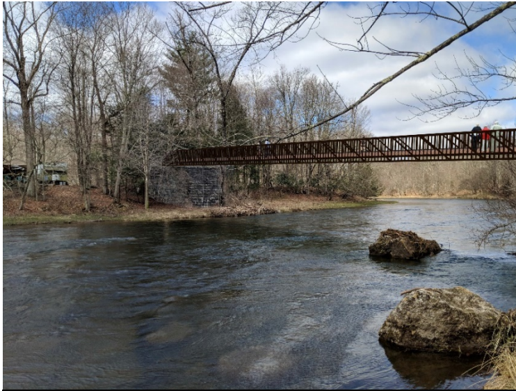
Conceptual rendering of the Neversink Crossing