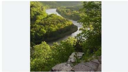
Message: The Best Small Towns in the Catskills for Hiking, Boutique Hotels, and Breweries https://fa.l.cn/3mIPV