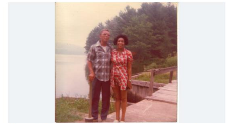
Message: Mid-century scenes from Narrowsburg's Lucky Lake described as "America's First and Only Inter-racial Lake Colony"

Post impressions Post clicks 7,471 1,654