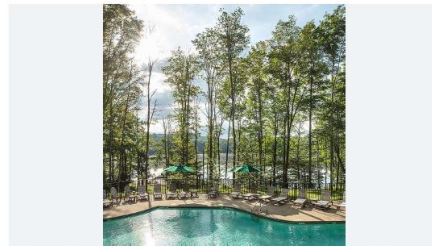
Message: Great article on the Chatwal Lodge in Travel + Leisure! https://www.travelandleisure.com/hotels-resorts/hotel-openings/chatw...

Post impressions Post clicks 7,471 1,654