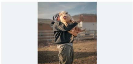
Message: Contact Arthursacresanimalsanctuary@gmail.com for tour availability. Reservations will be first come first serve. Tours are also op...