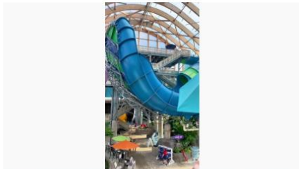
Message: Splash into adventure this Spring at @thekartrite - New York's BIGGEST Indoor Waterpark located right here in the #sullivancatskills. ...