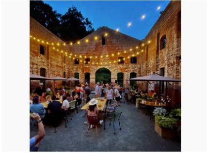
Message: Enjoy delicious food and treats under the stars at Cocheton Pump House! 🍷 🍴 You won't find an experience like this anywhere else...