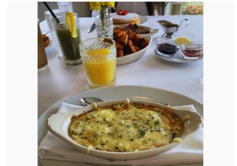
Message: Rise and shine! Start your day with a delicious breakfast at Kenoz Hall. ☀️ 📍 . . #catskills #mysullivancatskills #sullivancounty...