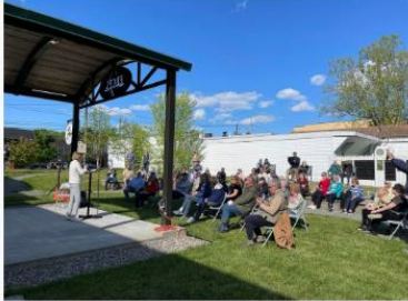
Message: The Borscht Belt Historical Marker Project unveiled its first historical marker today at the Ethelbert B Crawford Library in Monticello...