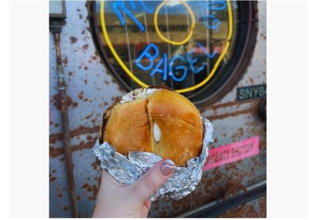
Message: Start your day off at Monticello Bagel Bakery with one of their delicious bagels and some freshly-brewed coffee - there's nothing better...