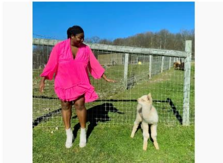
Message: Come see our furry friends at Buck Brook Alpacas, Inc.! Their farm is the perfect place to bring your family for a memorable day...