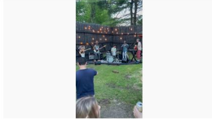
Message: @upperdelawareshadfest- the Festival of the Founding Fish, returns to Narrowsburg's Fort Delaware on Saturday, May 20! In the...