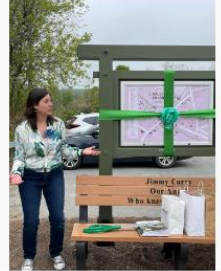
Message: The Livingston Manor Chamber of Commerce unveiled a new way finding sign in Livingston Manor today. The new walking map is...