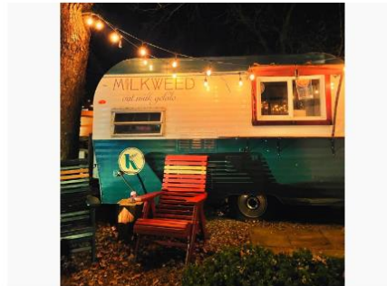
Message: Milkweed Oat Milk Gelato is a humble oat milk gelato camper right outside The Kaatskeller in Livingston Manor. 🍦 They're local,...