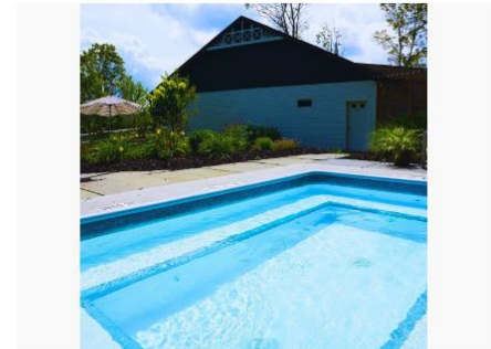
Message: When you stay at Kenoza Hall, make a SPLASH in their outdoor swimming pool! 🏊 ☀ Summer is right around the corner - let's make it ...