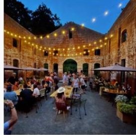
Message: Enjoy delicious food and treats under the stars at Cochection Pump House! 🍷 🍰 You won't find an experience like this anywhere else...