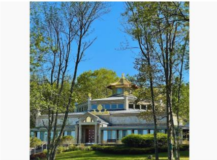
Message: Escape to a world of peace and relaxation at Kadampa Meditation Center New York in the Catskills! 🌿 🧘 Their Buddhist...