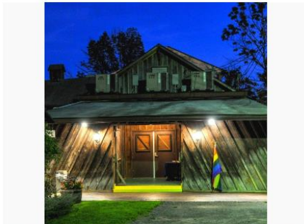
Message: At Forestburgh Playhouse, they celebrate Pride 365 days a year! But, they are especially excited to offer programming this Spring, Summe...