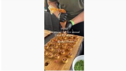
Message: We're still daydreaming about @catskill_cuisine last Saturday! Were you with us at the first annual food festival? We want to see your...