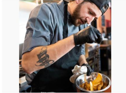
Message: Nothing screams 'yum!' like a delicious meal from @TangoCafeHurleyville! 🍴 📍 : @tangocafehurleyville . . #catskills...