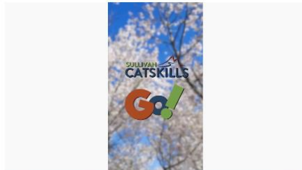
Message: It's time to plan your spring getaway to the Sullivan Catskills! ... #catskills #mysullivancatskills #sullivancountyny...