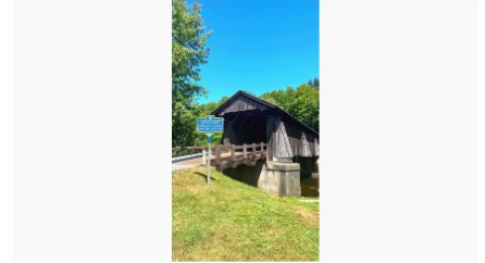
Message: Oh the places you'll go in the Sullivan Catskills. @theakaatskeller @villaromaresort @kartriteresort