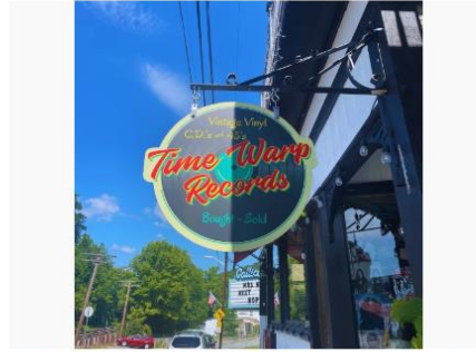
Message: Get ready to rock with Time Warp Records Callicoon! 🎵 🎸 With their amazing selection of music records, you won't want to miss out on...