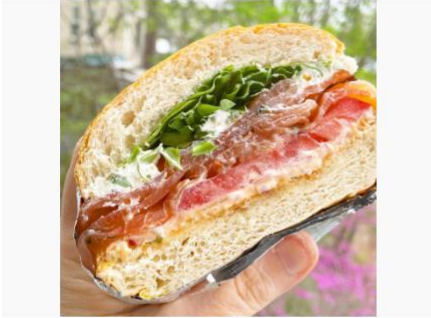
Message: The Heron Restaurant is reopening on June 17! Try their homemade Gravlax recipes available in 3 tasty forms to tantalize your...