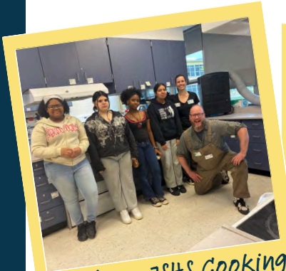
Fallsburg JSHS Cooking Club