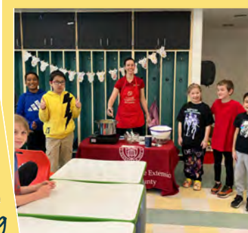
Sullivan BOCES upper elementary students say cheese