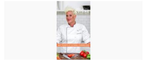
Ad Name: Catskills Cuisine Celebrity Chefs Ad Campaign Name: Conversions Campaign