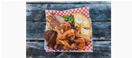
Ad Name: Catskills BBQ Event Boost Campaign Name: Catskills BBQ Event Boost