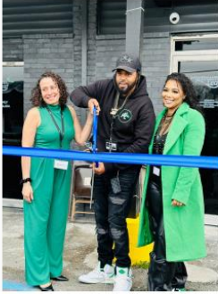
Message: Join us in welcoming Sullivan County's first Adult Use Dispensary, Platinum Leaf! On Friday, we joined the Sullivan County...