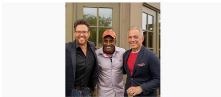
Ad Name: Geoffrey Zakarian Post Boost Campaign Name: Geoffrey Zakarian Post Boost