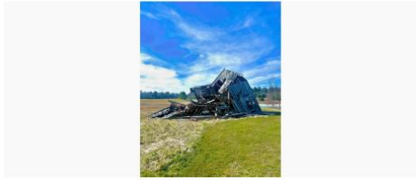
Message: We've lost a legend, folks! 🙏 This weekend the iconic, leaning home at the intersection of Route 17b and Pucky Huddle Rd. in Bethel,...