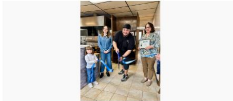
Message: 🍷 New restaurant alert! @lorenzobistro is now open in The Sullivan Catskills! It was great to celebrate the contributions Lorenzo and...