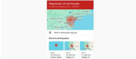
Message: Did you feel the earthquake today? We just felt an aftershock!