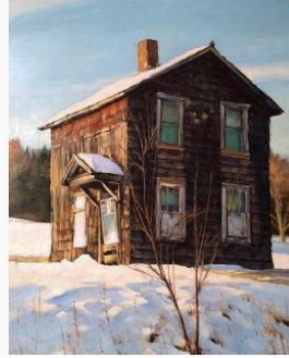
Message: We've lost a legend, folks! 🥺 The iconic, leaning home at the intersection of Route 17b and Pucky Huddle Rd. in Bethel, the "Halsey..."