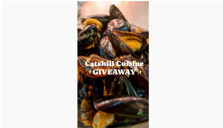
Message: Contest has ended, thanks for entering! Win a VIP weekend for 2 at @catskill_cuisine on May 11 at @bethelwoodcenter including a hotel stay at @resortworldcatskills! To enter: follow @sullivancatskills follow...