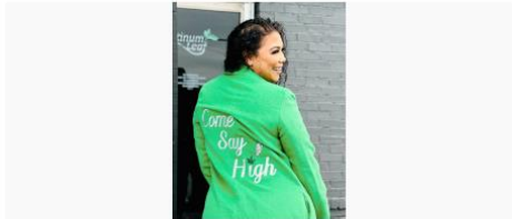
Message: Join us in welcoming Sullivan County's first Adult Use Dispensary, Platinum Leaf! On Friday, we joined the Sullivan County...