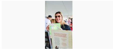
Ad Name: Catskill Cuisine Tickets Sales Ad - Updated Campaign Name: Traffic Campaign