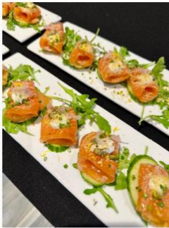
Message: 🍷 Restaurant week is almost here! Check out the pics from the press event yesterday at Hurleyville Arts. It was delicious! Hit the town &...