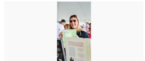
Ad Name: Catskills Cuisine Ticket Sales Ad Campaign Name: Traffic Campaign