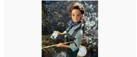
Message: It's opening weekend! Click the link in our bio for a full list of events happening in @livingstonmanor and @visitroscoe 🎣...