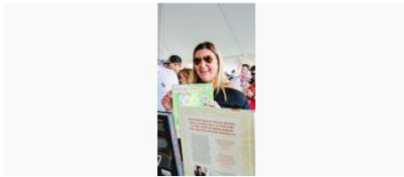
Ad Name: Catskills Cuisine Ticket Sales Ad Campaign Name: Traffic Campaign