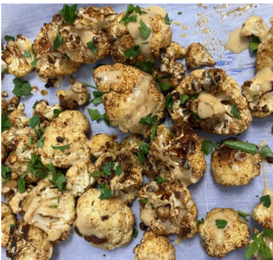
Featured recipe in Mrs. Ruggles' classes: Roasted Cauliflower with Maple Tahini Dressing