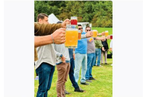
Message: 🍷 Oktoberfest at Roscoe Mountain Club was a blast! Beer lovers 🍷 Make plans to continue the celebration this weekend at Big Ed...