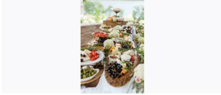
Ad Name: Wedding Venue Ad Campaign Name: Traffic Campaign