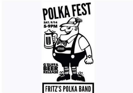
Message: It's going to be another beautiful weekend in The Sullivan Catskills! Take a look at what is going on :)