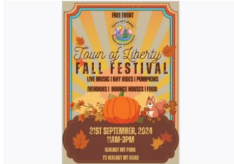
Message: ☀️ The weather is looking great with sunny skies and highs in the mid-60s this weekend! What are you planning to do? Let us know in t...