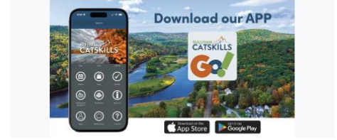
Ad Name: Sullivan Catskills GO Campaign Campaign Name: Sullivan Catskills GO Campaign