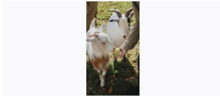
Ad Name: SCVA x Breeze Airways Contest Ad Campaign Name: SCVA x Breeze Airways Contest Boost