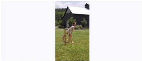
Ad Name: Summer Ad V2 Campaign Name: Traffic Campaign