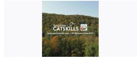
Ad Name: Fall Offer 2 Ad Campaign Name: Traffic Campaign