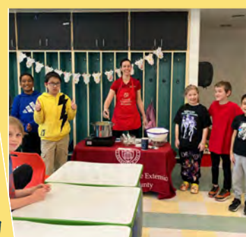
Sullivan BOCES upper elementary students say cheese