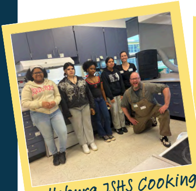
Fallsburg JSHS Cooking Club