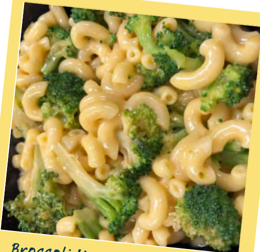
Broccoli Mac and Cheese ft. dairy, whole grains, AND veggies!