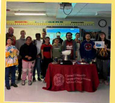
Sullivan BOCES students say cheese!