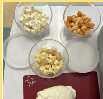
Tonjes Farm Dairy samples